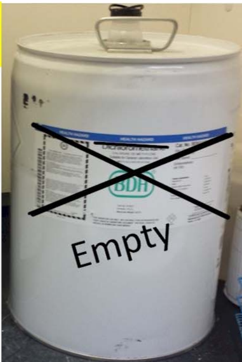
OK to place in trash/dumpster

To dispose of empty chemical containers: