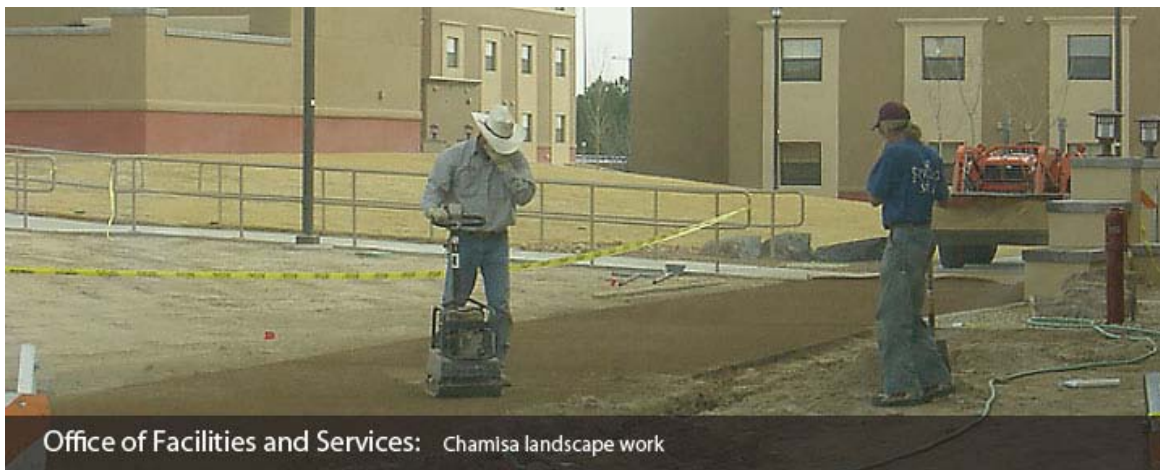
Office of Facilities and Services: Chamisa landscape work

Environmental Health and Safety and the Office of Facilities Planning and Construction were integrated into a single division with the Office of Facilities and Services on July 1, 2010. The new organization chart may be found here .