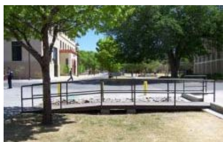
The Frenger footbridge spans a storm water drainage ditch adjacent to the International Mall.

The program fulfills an Environmental Protection Agency requirement that the university take steps to reduce the discharge of any pollutants as much as possible.