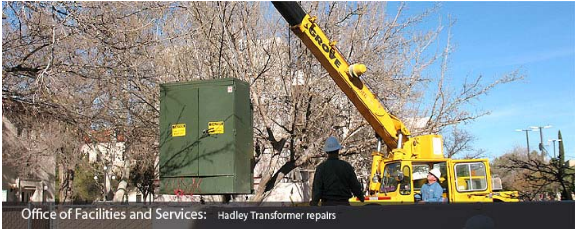
Office of Facilities and Services: Hadley Transformer repairs

You are here: » NMSU » Faculty and Staff » Office of Facilities and Services » Storm Water Mgt. Pgm.